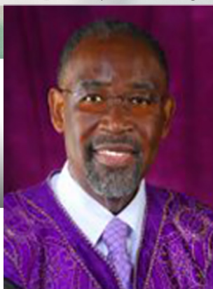
Ninth Episcopal District Chair, AMEC Commission on Economic Development