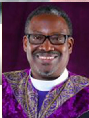
Sixteenth Episcopal District Co-Chair, AMEC Department of Retirement Services