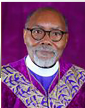
Fourth Episcopal District Chair, AMEC Department of Retirement Services